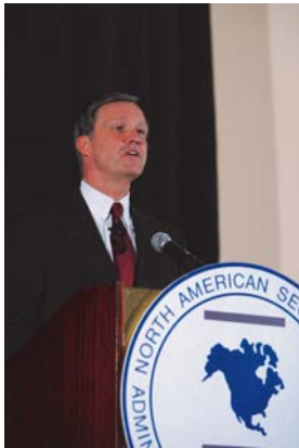
SEC Chairman Christopher Cox addresses the NASAA Spring Conference.

“Together, we can accomplish a lot of good for investors and for our economy.”