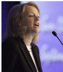
NASD Chairman and CEO Mary Schapiro

NASAA and NASD have done a lot of good work together over the last few years – work that both you and we can be proud of. And what better example than the Waddell & Reed variable annuity switching case? That led to $7 million in fines paid to NASD and state regulators last year, and $11 million in restitution to be paid to Waddell & Reed's victims all around the country. I hope and expect our collective action on that case will lead others to think carefully about their clients' best interests when persuading them to switch annuity contracts.